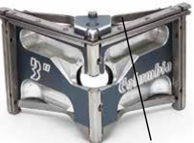
Stainless steel wings last much longer than nickel plated