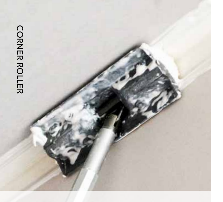
Embed tape fast in all angles without dragging tape.