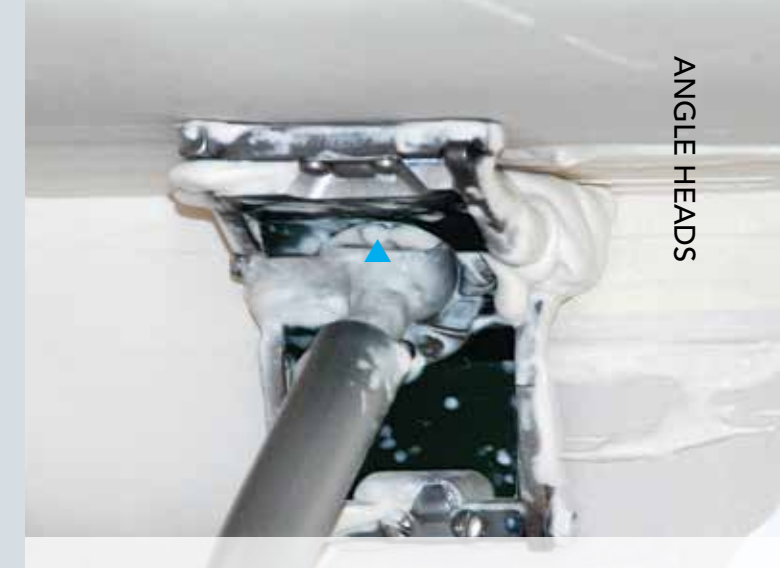
"Fool Proof" Locking Mechanism locks Angle Head on the ball

Purpose: Used in 90° internal angle joints after corner roller to evenly feather compound over tape.